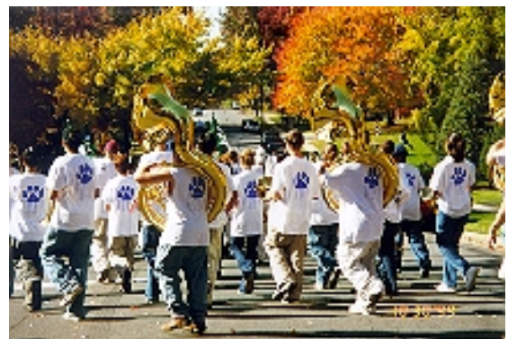
Scenes from the parade. Above: Brownie Troop 2412. Right: The Falls Church High School Band.

We will look forward to seeing you all in costume at next year's Halloween parade!