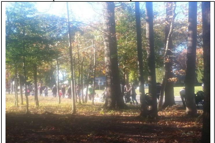
Halloween Paraders at the start of the parade on their way up Camp Alger Avenue toward Norfolk Lane.

☺ Halloween Parade Success! The weather was perfect for our annual Halloween parade on October 26 th . With over 30 children and their parents, plus half a dozen dogs in attendance, our ninjas, Elsas, ducks, and turtles took the neighborhood by storm. We followed bagpiper Eric (see his ad on Page 2) in a loop around the neighborhood and reconvened in the Woodley Pool picnic area for temporary tattoos, a pumpkin craft, glow-in-the-dark nail painting, and the all-important chocolate candy!